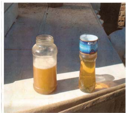
US Embassy United Arab Emirates After 1-Pass Thru DPS

AN EASY TO USE SYSTEM FOR IN-HOUSE MAINTENANCE OF STORED DIESEL FUEL