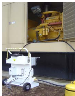
Mohegan Sun Casino DPS-600 Portable