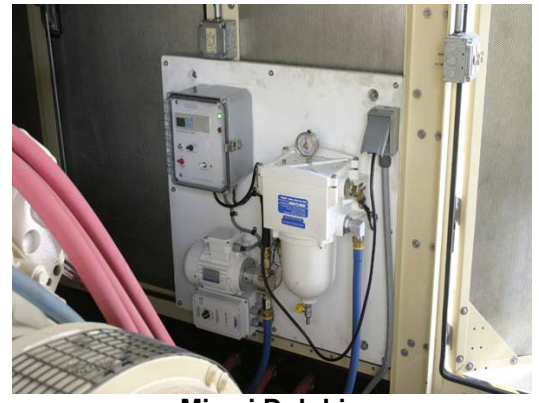
Miami Dolphins DPS-600 Wall Mounted (NEMA 3R Enclosure Optional)

AT&T Official in Texas discussing Lessons Learned from Hurricanes Rita & Katrina