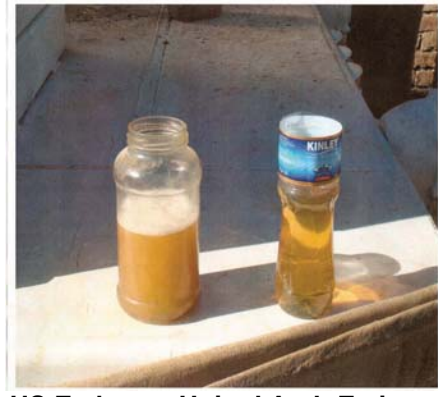
US Embassy United Arab Emirates After 1-Pass Thru DPS

AN EASY TO USE SYSTEM FOR IN-HOUSE MAINTENANCE OF STORED DIESEL FUEL