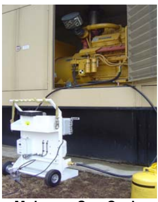
Mohegan Sun Casino DPS-600 Portable